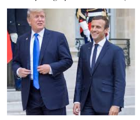
Emmanuel Macron with Donald Trump

The young dynamic Macron (more on that dynamism later in the chapter) came as a