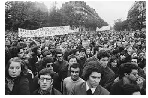
A Typical Protest in 1968

The turning point occurred no later than May 1968, when a wave of strikes and demonstrations paralyzed the country. The movement started innocently enough. Facilities at the suburban branch of the University of Paris in Nanterre were shoddy. Students chafed under strict rules regarding dormitory life at what had been billed as France's first American-style campus. To protest what they believed were intolerable conditions on these and other fronts, a small group of student