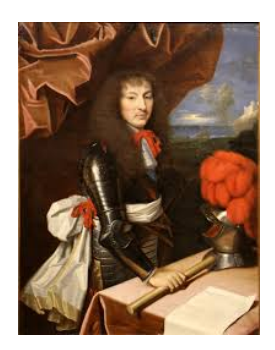
Louis XIV: Source Wikimedia

The church had been the monarchy's strongest ally. Many of the best-known leaders of the ancien régime , including Armand Jean du Plessis Richelieu, Jules Mazarin, and Jean-Baptiste Colbert, were cardinals as well as ministers to the king. The revolution of 1789, therefore, not only overturned the monarchy but also reinforced already heated disputes over the political role that the Catholic Church should—or should not—play.