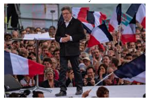
Jean-Luc Mélenchon

The PCF was already in trouble when the end of the cold war removed socialism as a