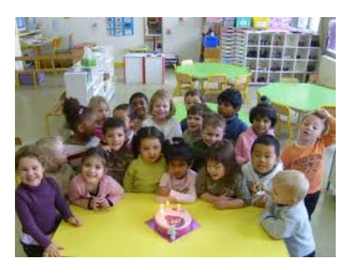
A Typical Ecole maternelle

gone, but the payment scheme remains on the books. France also has one of the world's most extensive government-run preschool programs, which guarantees almost every child a spot in a program staffed by trained teachers. Finally, France is one of the few governments that still cover virtually all tuition costs for higher education in addition to funding the grandes écoles which actually pay their students, because they officially become government employees when they enroll.